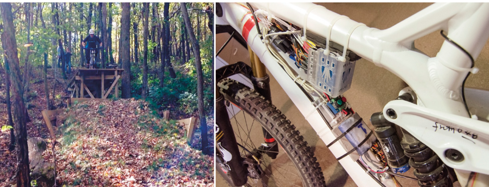
Figure 1. (Left) The Abaqus/True Load simulation used two extreme events to test drive the bike’s load cases: Deer Hunter (shown above: a bike and rider poised to drop from a raised platform down to the ground) capable of fully compressing the rear suspension, and Mojo, a jump that did the same but also allowed the rider to rotate the bike. Figure 2. (Right) Strain gauges attached onto a bike frame.

Using True-Load and Abaqus, the team set up a linear static model in which the boundary conditions and unit load cases mirrored the field-collected data from the bicycle frame (see Figure 3). The material model and mesh also reflected exact strain-gauge placement and orientation—all critical fine-tuning that wouldn’t have been possible without Abaqus and True-Load, Maas says.