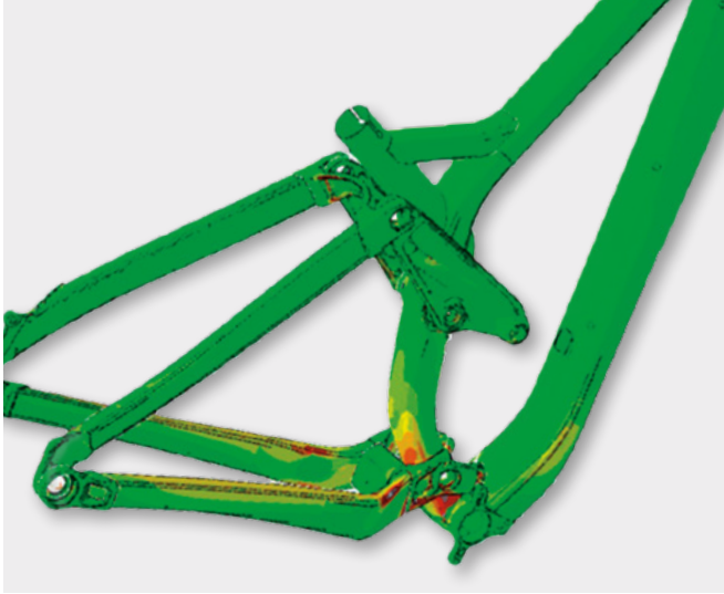
Figure 3. Abaqus/True Load model.

Strain data is extracted from the event file for when the bicycle is in a quasi-steady state and when the suspension is fully compressed. This also corresponds to the peak loading during the event. This strain data is used within True-Load/Post-Test where unit loads are scaled throughout time to minimize errors between the FEA strains and the measured strains. The resulting loads created a near perfect match between simulated strain and measured strain.