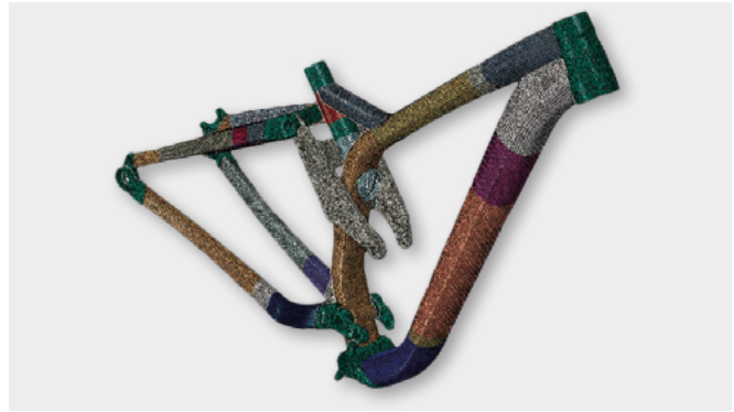
This Abaqus model of a Trek full-suspension mountain bike depicts solid and shell elements linked with constraints and connectors, a welded butted aluminum frame, and a magnesium rocker link.

The bike manufacturer took its first spin with simulation in 2009, complementing its use of the Dassault Systèmes CATIA 3D design and engineering applications with the Abaqus finite element analysis (FEA) application from SIMULIA. Trek's